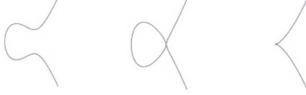
Figure 1: The three possibilities for the curve x_1^3 + ax_1x_2^2 + bx_3^3 - x_2^2x_3 = 0 : an elliptic curve, a curve with a double root, and a curve with a cusp.

generated by x_2^3 , (tx_1 \pm r(t)x_2 + x_3)^3 , for any t \in \mathbb{C} , and by all monomials of degree 4. We have